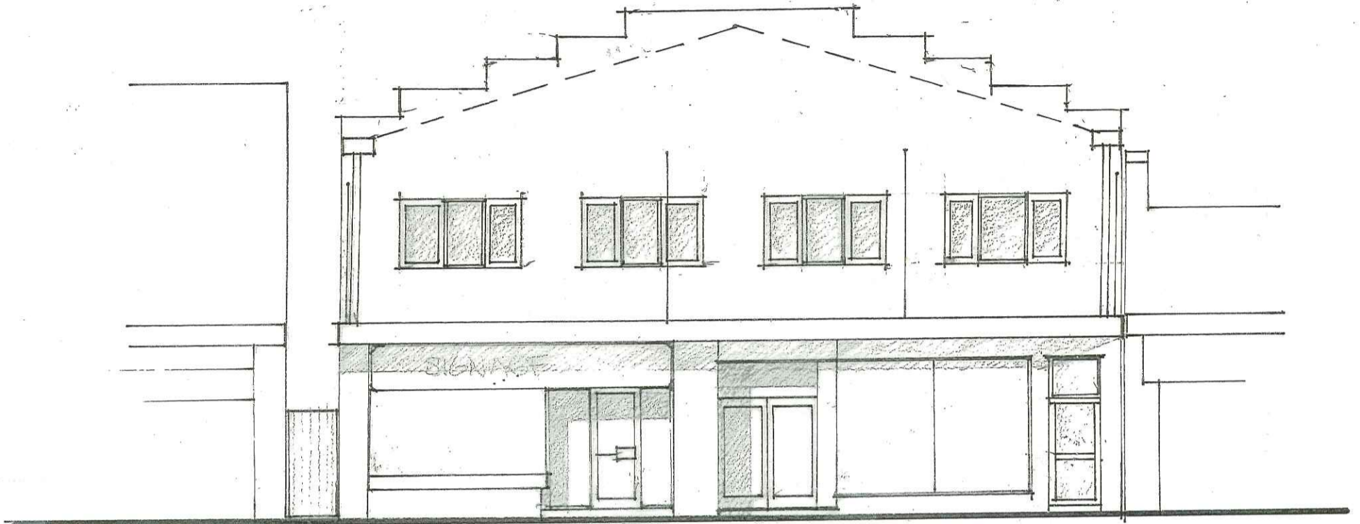
EXISTING STREET ELEVATION